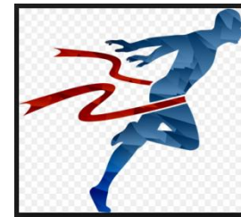
TABLE TOPICS AND INTERNATIONAL SPEECH CONTEST