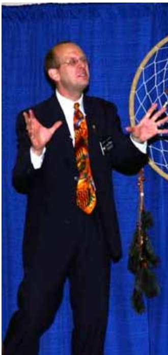
Funny man Darren La Croix regaled conference attendees with his unique style of “clean comedy” during Friday night’s “Just for Fun” session.