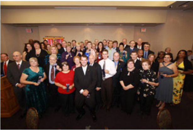
District 25 President's Distinguished Clubs