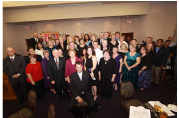
District Governor's Award — 20+ Clubs