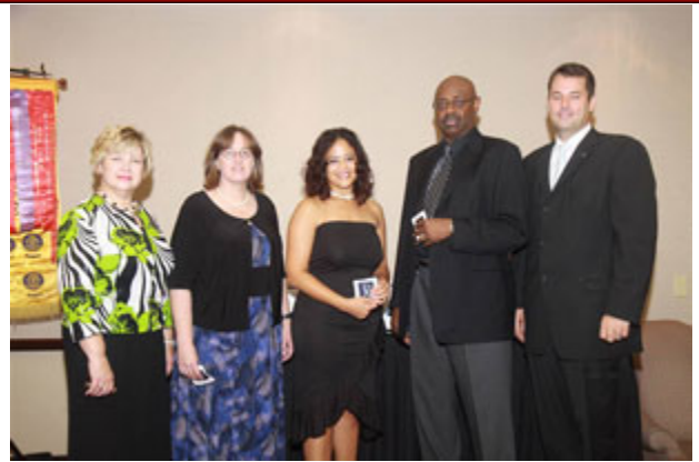
District 25 Phoenix Award Winners