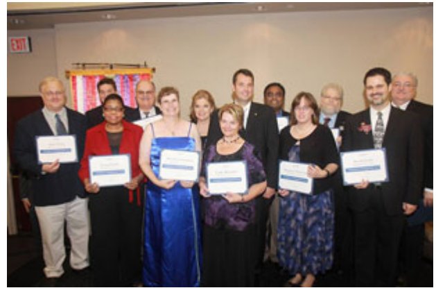
District 25 President's Distinguished Areas