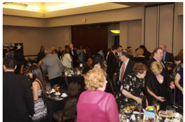
Sold Out District 25 Awards Banquet