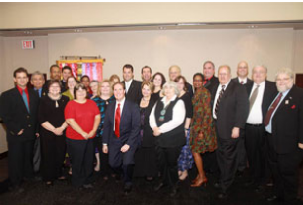
District 25 Elite Winners