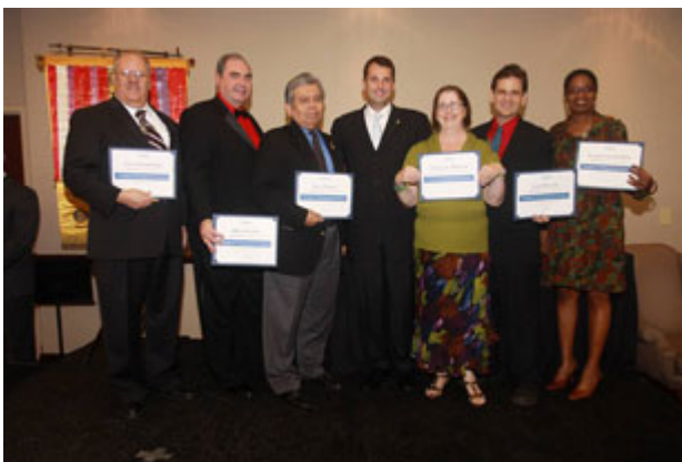
District 25 President's Distinguished Divisions